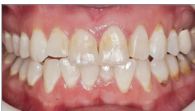
Pre-Op Retracted View-Closed