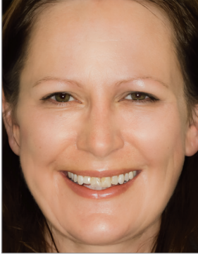
FULL FACE (Pre-Op Lip Line)