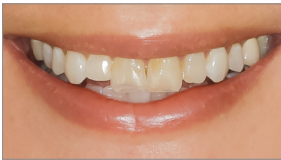
REPOSE (Pre-Op Lip Line)