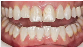
Pre-Op Retracted View-Open