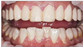
Temps Retracted View-Open