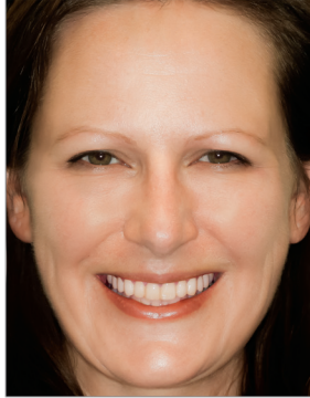
FULL FACE (Temps Lip Line)